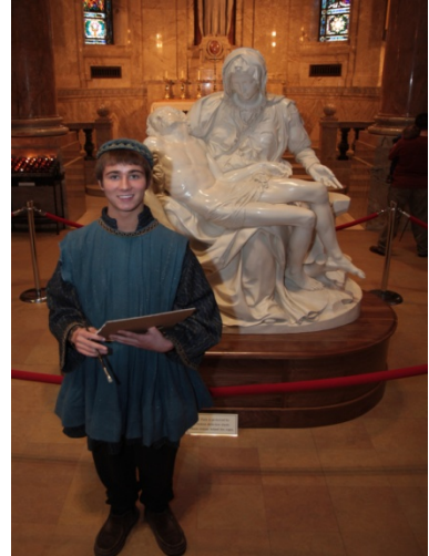
“Michelangelo” and his masterpiece, La Pietà